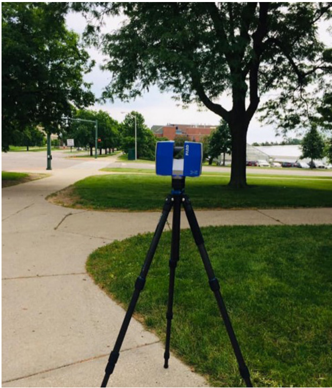
Figure 1. The FARO Focus 3D terrestrial laser scanner is available in the Urban Forestry lab at the College of Forestry, Wildlife, and Environment at Auburn University. The scanner head is mounted on a tripod.